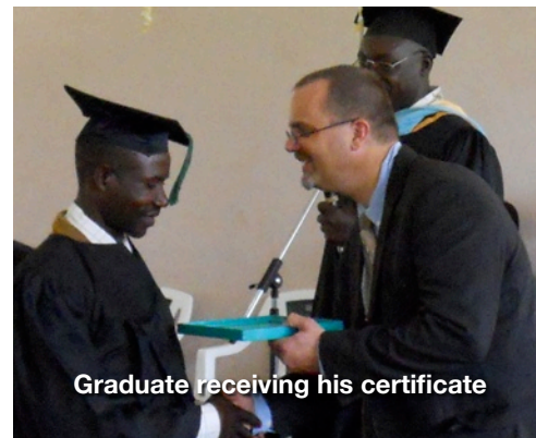
Graduate receiving his certificate

This year, MTI had its 10th graduation! For 10 years, students have marched in cap and gown across the floor to get their certificates. The smiles on their faces for the accomplishments they have achieved are priceless. Twenty students graduated this year, one of them a Deaf person! As they march on to their prospective ministries, we once again wait in anticipation to hear reports of their efforts in sharing the Bible with others. We are proud of these students, and proud to be a small part of this ministry as well. ■