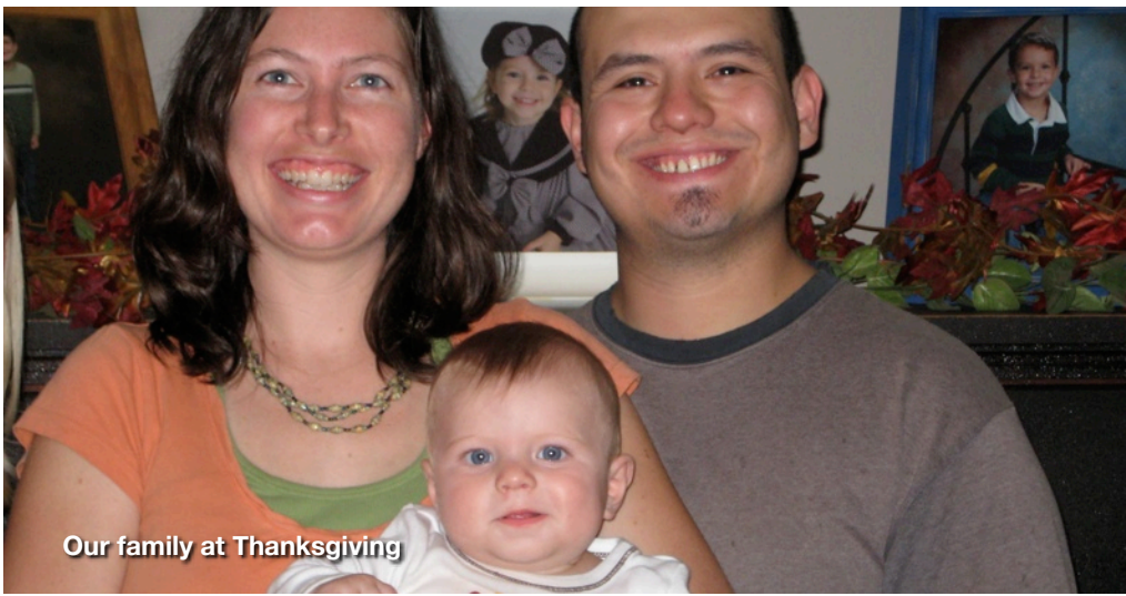
Our family at Thanksgiving