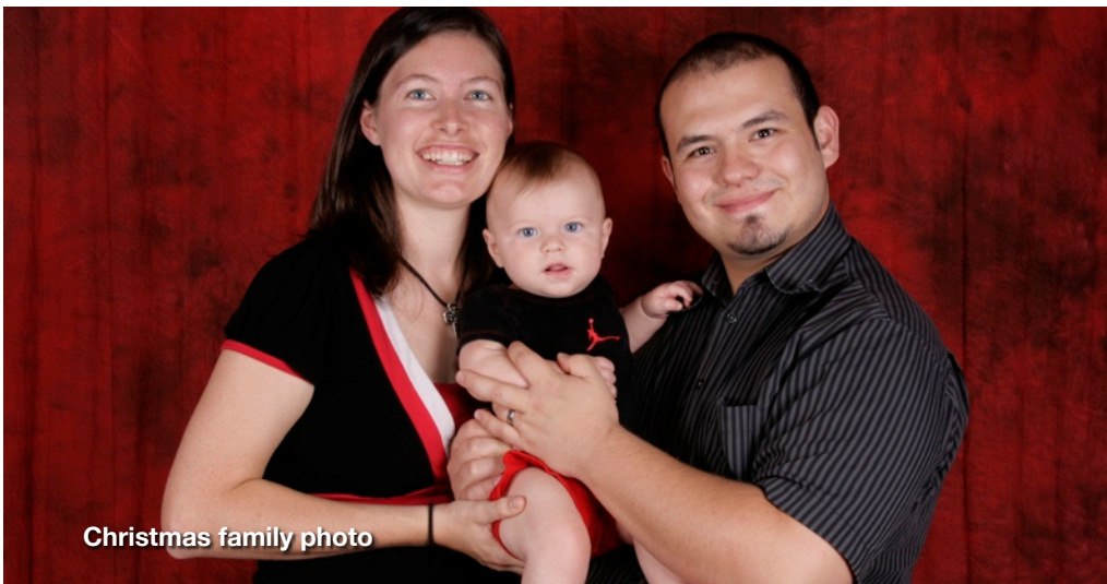
Christmas family photo